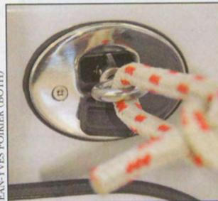
JEAN-YVES POIRIER (BOTH)

Fitting an accessory to the boat is as simple as pushing a key in a lock: insert it at a 45° upward angle, push it downward, and lock it with a slight pull. Reverse the order to demount it.